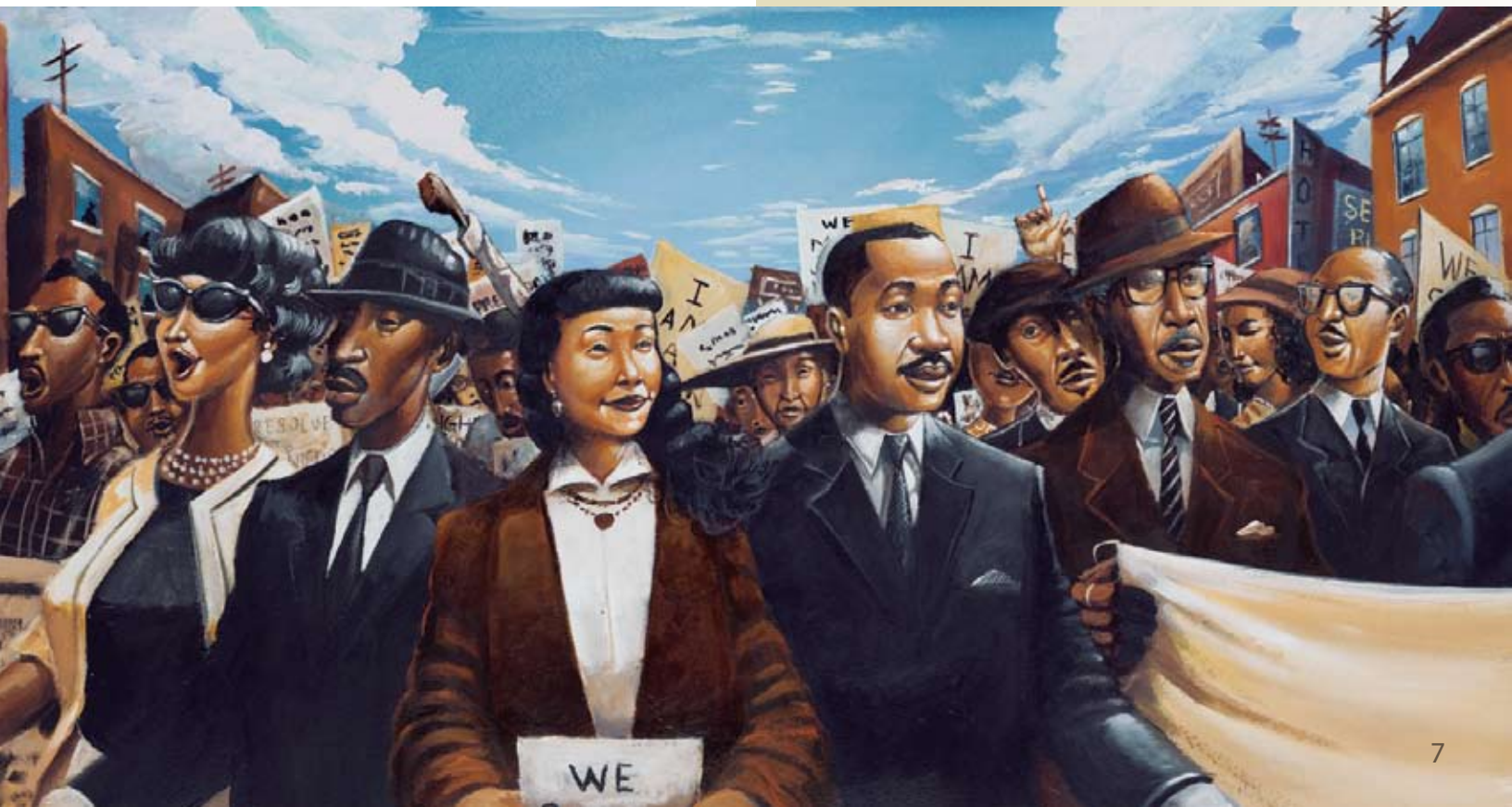
Illustration by Frank Morrison ©